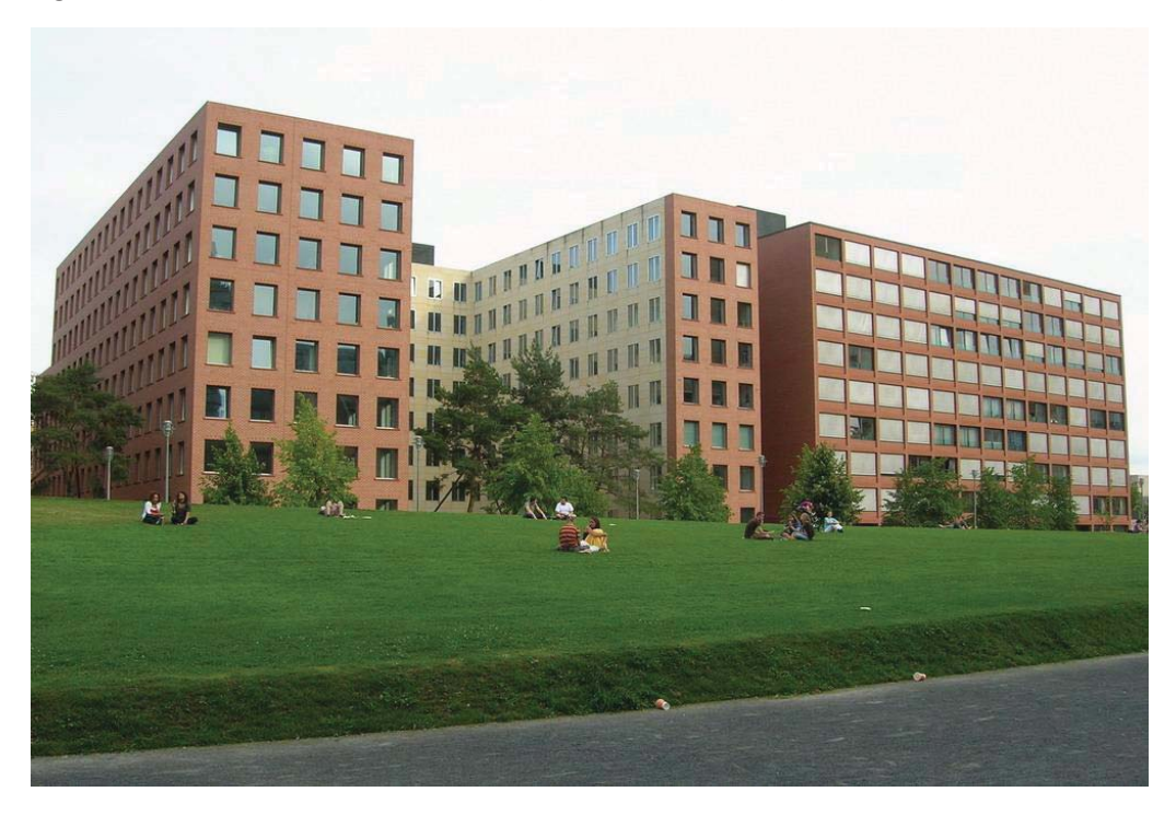
Figure 3: Potsdamer Platz, Park Kolonnaden, Berlin, Germany. (Pasquale De Paola, 2002)