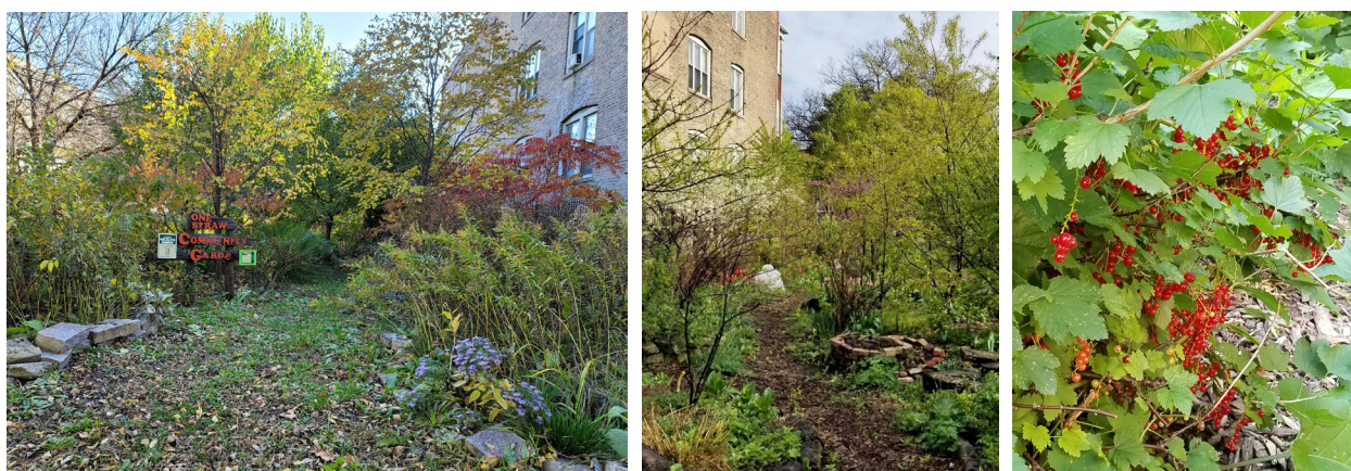
Figure 3: One Straw Community Garden.