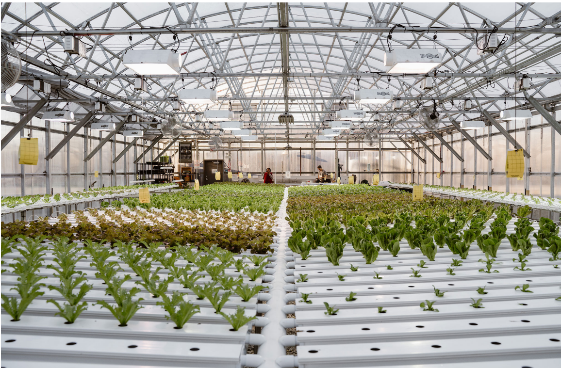
Figure 4b: Herban Produce, hydroponic greenhouse.