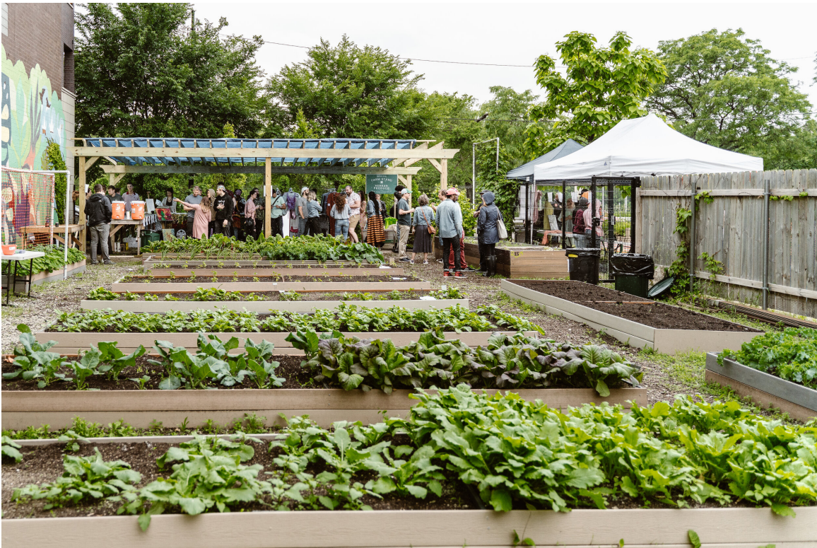
Figure 4a: Herban Produce, outdoor raised beds.