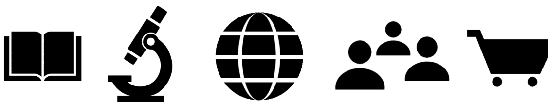
Figure 5: Aims of urban agriculture; scientific-educational, cultural, economic-social.

the course of this research, they completely revamped their website to make access to information even more straightforward and reflect their new mission as a BIPOC-led organization working to empower marginalized and indigenous people. Another noteworthy initiative is the Chicago Urban Agriculture Mapping Project, launched in 2015 to provide the public with a comprehensive view of the state of urban agriculture in Chicago. The map now displays 826 growing spaces within Cook County, Illinois ("Chicago Urban Agriculture Mapping Project," n.d.). With its supportive government and urban policy, active grower and consumer network, and advocacy and education partners, Chicago's urban agriculture is flourishing.