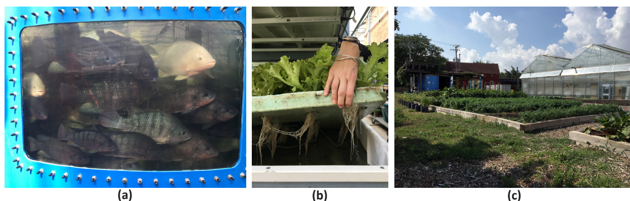
Figure 2: Farm on Ogden (a) Aquaponics tank holding mature fish (b) Hydroponic growing beds (c) Outdoor raised beds and greenhouses.