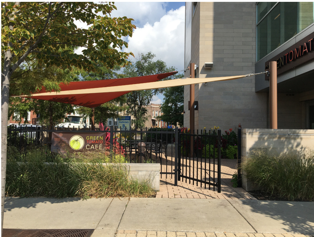
Figure 1b: Green Tomato Café, Chicago. Source: Author 2021.