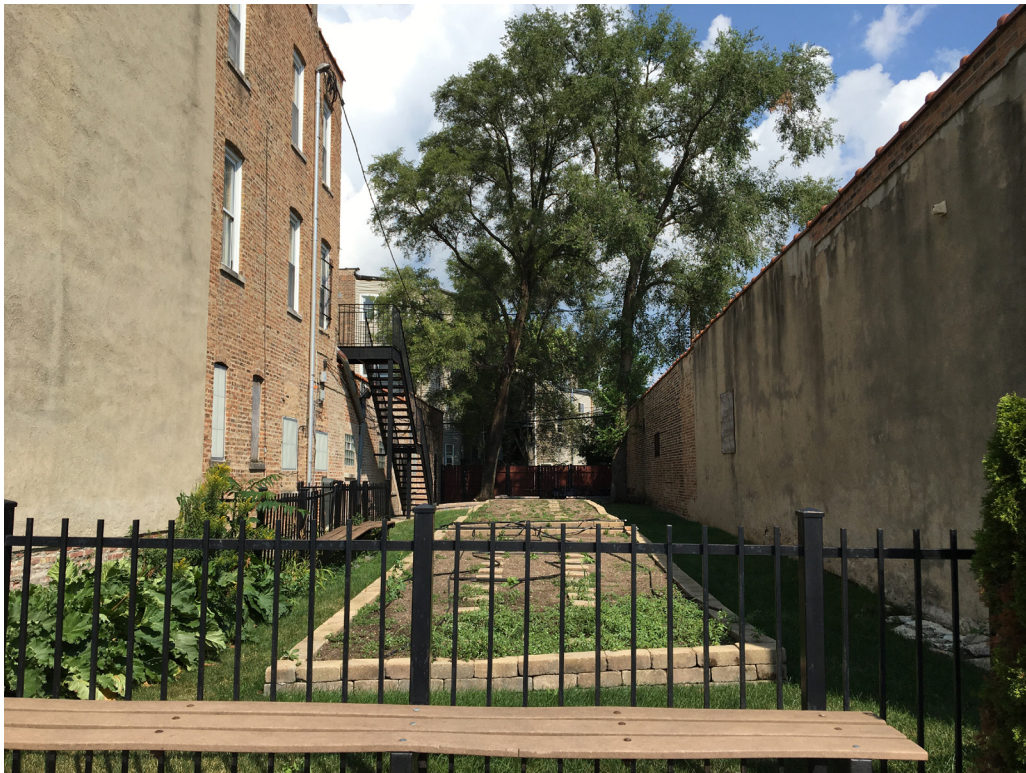
Figure 1a: LCHC urban garden.