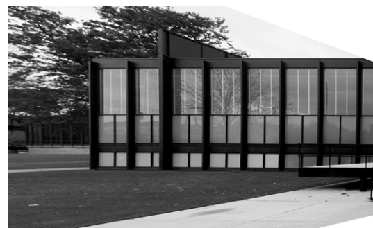
Figure 2: Manipulated copy of Figure 1: elevation oblique.

Shifting image projection from perspective into elevation appears to deny the relevance of the photographer's physical point of view: images which, when considered in series, revealed the photographer's movement around the building over time, are flattened through rectification. This initially appears to support the NF hypothesis, because visual information about the architecture appears unaffected by the medium. However, an inspection of the rectified images shows that although the building's glass facade is indeed visually flattened (i. e., removed from a perspective view), those parts of the architecture which project beyond the facade – such as the overhead trusses and their associated columns – are highlighted through distortion. The projections become the obvious exception to an otherwise neutrally composed facade. This visual effect – a simultaneous flattening and spreading of