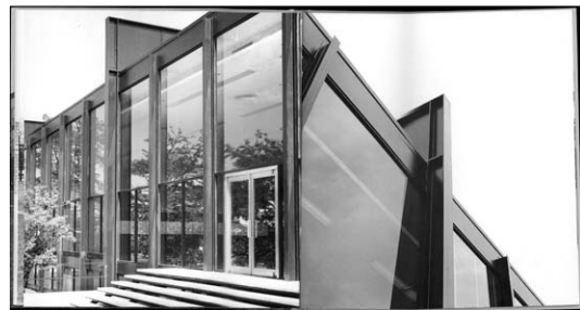
Figure 5: Examples of Werner Blaser's Crown Hall photographs.