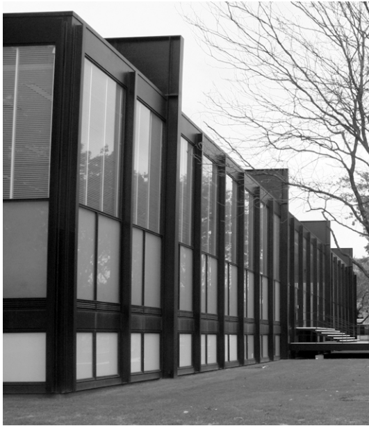
Figure 3: Crown Hall, IIT.

photographed depth – demonstrates that those attributes of a work of architecture the visibility of which are most dependent on a specific point of view are highlighted through deliberate flattening of the original images.