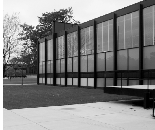
Figure 1: Crown Hall, IIT.

To illustrate by example, consider a well-documented work of architecture, Mies van der Rohe's Crown Hall at IIT in Chicago. The graphical distortion of original photographs (Figures 1 and 3) into elevation oblique projections (Figures 2 and 4) is possible using simple techniques in Adobe Photoshop.