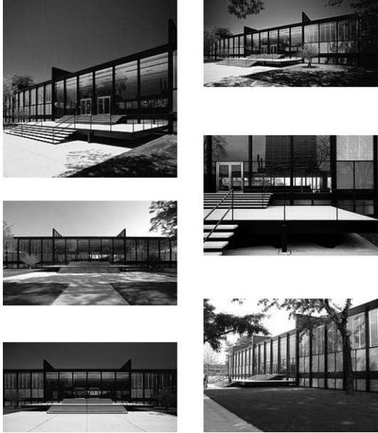
Figure 6: Examples of Crown Hall photographs resulting from a search conducted on Flickr.

Drawings of Crown Hall in plan and elevation illustrate the positions, points of interest, and fields of view of the photographs from each of the two sources (Figures 7 and 8). These drawings constitute a way of asking Where are the photographs being taken from? and What are people looking at? Figure 7 – recording the first twenty exterior image results from a Flickr search for Crown Hall – does not in any obvious way simulate the experience of visiting the building. Instead, it registers the visits of many people by describing a specific space of photography created by the superimposition of visitors' fields of vision. It indicates visitors' tendency to photograph the building from one side; indeed, not a single image in the first hundred Flickr image results was taken from a point where the front facade of Crown Hall was not visible. Figure 8, by contrast, registers the purposeful visit of an individual photographer engaged in the production of a scholarly work. The space of photography in Figure 6 registers not only this attempt to document the building in an academically useful manner, but also by inference a process of editorial selection from which several candidate images were certainly removed.