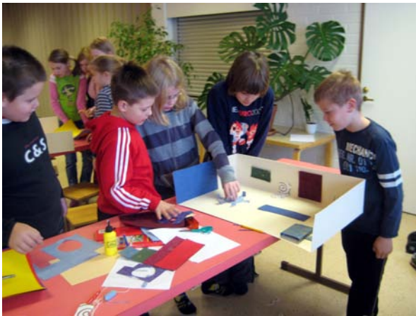
Figure 3. A group of boys (age 10) constructing their "new learning space".