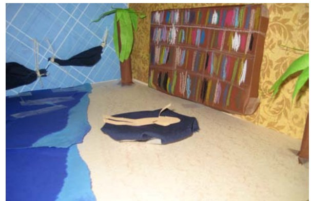
Figure 5. Portugal brought into the class room: hammocks and a book shelves on the sea shore.

"What begins as undifferentiated space becomes place as we get know it better and endow it with value... The ideas "space" and "place" require each other for definition. From the security and stability of place we are aware of the openness, freedom, and threat of space, and vice versa. Furthermore, if we think of space as that which allows movement, then place is pause; each pause in movement makes it possible for location to be transformed into place." (Tuan 1977, 6)