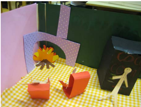
Figure 7. A fireplace brought into the class room.

What if we designed in order to please all of our senses? Suppose for a moment that sound, touch, and odor were treated as equals to sight; and emotion considered as important as cognition. What would our built environment be like if sensory response, sentiment, and memory were critical design factors, the equals of structure and program? Sensory Design (Malnar and Vodvarka 2004) could explore the nature of our responses to spatial constructs - from various sorts of buildings to gardens and outdoor spaces, to constructions of fantasy. This kind of thinking is also involved in the Finnish architectural familiarizing for children; one that could be seen sharply contrast with the Cartesian model of seeing that dominates the architecture today.