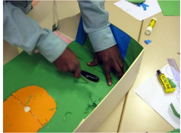
Figure 8. The space (the scale model of the class room) evolving into a foot ball field.

In these Jakomäki workshops we have to also remember the social status to be a little bit lower there and the prominent proportion of immigrant families living in the area. Some of the children had yet no shared language or possibly they had not learned to read and write (even if they were already 12-14 years old but having moved to Finland only recently). In Finland we are used to think that every child can read and write after the first year at school (age 7-8; of course some learn earlier). Those boys and girls who were not having language skills could quite nicely use their handwork skills. Foreign countries were brought in to the learning space: Turkey and Portugal were mentioned (perhaps memories from vacations with families) but we saw images also from Russia and Somalia in Africa, from where some of the children were immigrated. In a few models was a foot ball field inside the class room: children can also learn by moving and playing; or some boys had just brought their favorite place in to the space to make it their own.