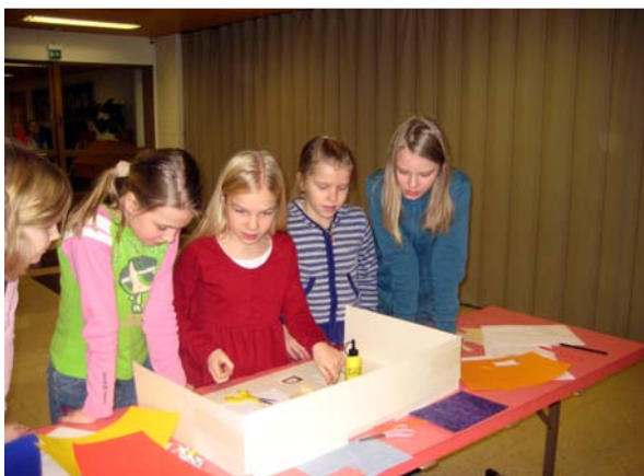
Figure 4. A group of girls (age 10) thinking together materials and furniture in their "learning space for the future".