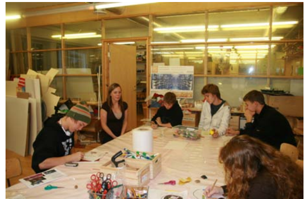
Figure 2. Working around the table at the Arkki School.

School of Architecture for Children and Youth in Helsinki). The purpose of the workshops was to examine children's visions for a future school and its spaces. Students in two age groups (7-11 and 12-18) were producing ideas of their own in scale models, texts and drawings for the school building and the environment. In that phase our main interest was not only the spaces and places pupils were planning and designing, but also the process: In what ways can the collaborative planning and design process with children act as a tool for active citizenship and cultural learning, and how is this collaborating with the real planning and decision making process? (see appendix 1)