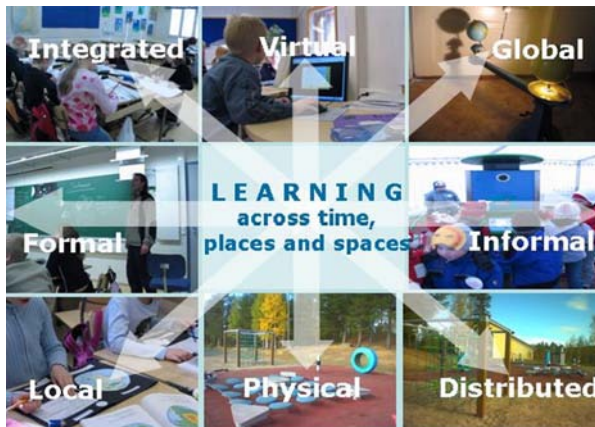
Figure 1. The multi-disciplinary research of InnoSchool.

Research material in InnoArch is gathered by various methods in collaboration with the existing comprehensive schools; their pupils, teachers and other staff. Project website is http://innoschool.tkk.fi/innoarch