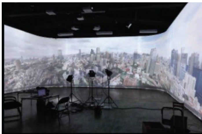
Figure 2: Photograph of the CRAIVE lab space at RPI during a mock-up

Our study was set-up in the 60' (length) x 55' (width) x 30' (height) Studio 1 black box performance space at the Experimental Media Performing Arts Center (EMPAC) at Rensselaer Polytechnic Institute. The studio space is acoustically isolated, and the black finishes and ceiling grid enable full light control and prevent unwanted light and color reflections.