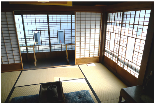
Figure 1. Interior 'Shoji' panels and 'Tatami' floors which are made of rice straw, featuring the multifunctional use of space by integrating sliding walls. Exterior 'Shoji' panels perfectly integrate indoors and outdoors. The tatami-mat layout and the use of plain wood express sensitivity to natural materials.