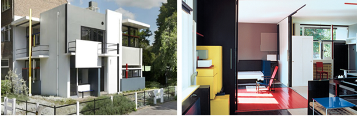
Figure 2. The Schroeder house elevation accentuates the relationship between vertical and horizontal planar forms (left). The upper floor interior with open partitions showing the full extent of the space (right).

For me, this house exudes a strong sense of real joy. That is absolutely a question of proportions, but here in this house, it's stimulated. I find it very important that a house has an invigorating atmosphere; that it inspires and supports the joy of living (Paul Overy et al., 1988).