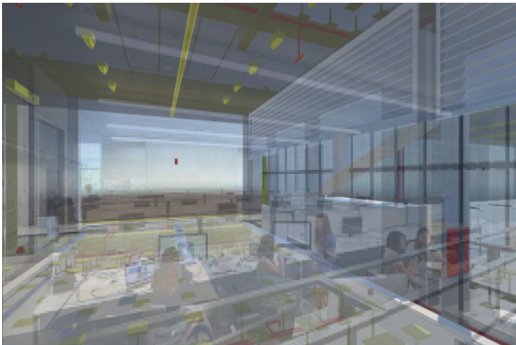
Figure 1: Simulated view using HoloLens showing projection of digital information on top of actual physical space.

The UA team used the HoloLens™ a head-mounted display (HMD) with a holographic computer that creates a blended environment where the user can view reality while also “seeing” overlaid holographic data. This allows the user to interact with digital content as part of the real world. Fig. 1 is an example of the way we employed AR (technically also refereed to as ‘mixed reality’) 1 using the HoloLens to identify heating and ventilation (bright yellow), fire suppression (red), and support elements (dark yellow) in Vol Walker Hall. By overlaying these images on reality, students were able to “see” the different components of the building while standing in the building space. Based on our experimental data our formative evaluation informed