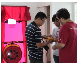
Fig. 2. Students conducting a blower door test for airtightness.