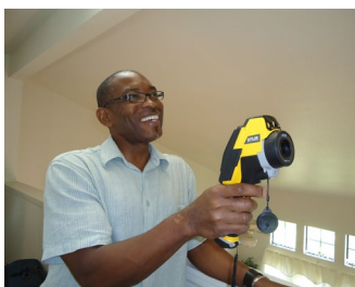
Fig. 1. Student researcher using infrared camera to identify thermal bridges.

College of Engineering students monitored electricity, managed energy use data, and compared it to regional energy use data to identify unexpectedly high consumption. The Information and Computer Sciences team members imported vast quantities of fine-grained historical metering data into a database for further analysis with their open source software. The existing building data collected informed a separate consultant's inputs to a computational whole-building energy simulation, which was then used to compare various energy efficiency improvement options for retrofitting the structures.